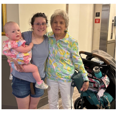
Happy grandparents and adorable grandchildren!