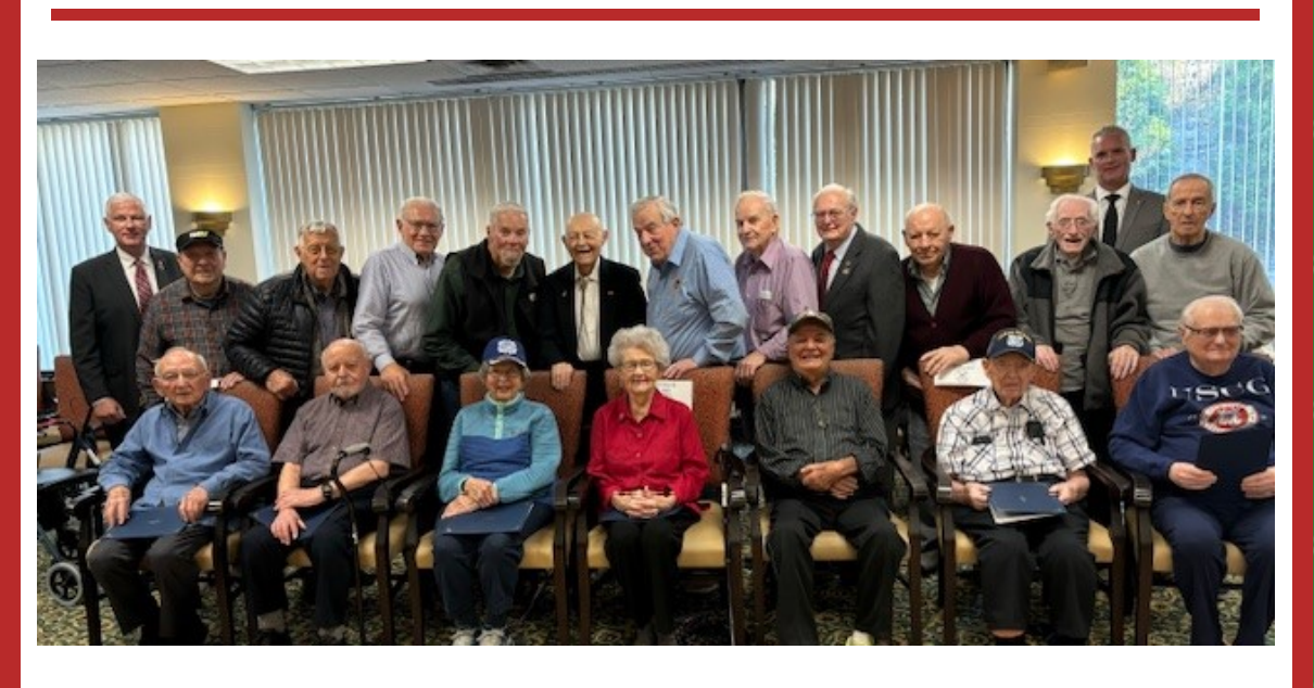
At this year's Annual Veterans Recognition Program , we were delighted to honor 20 of our very own who proudly served in the Army,